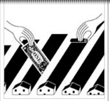
Op-Ed: Mortgage Justice Is Blind