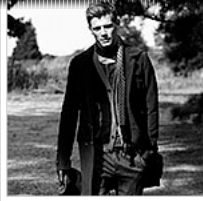
Looking Good: The Sequel