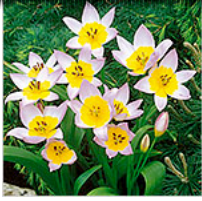
Persuading Bulbs to Bloom