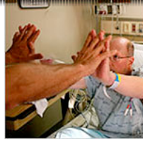
Patients Are Saying 'Om,' Not 'Ah'